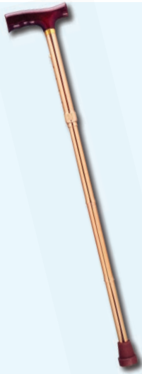
DE-41030 CHROME FOLDING WALKING STICK