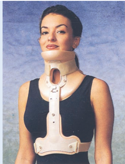
DE-10200 PHILADELPHIA STABILIZER