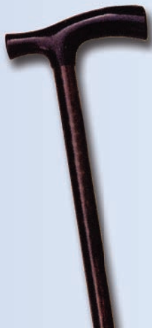
DE-41020 PLASTIC HANDLE