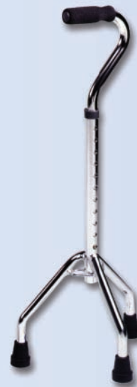
DE-41100 TRIPOD CHROME WALKING STICK