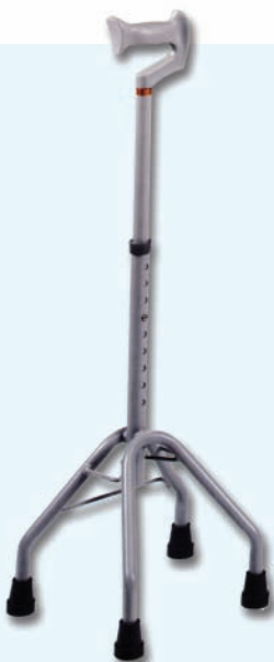
DE-41200 QUADRIPODE WALKING STICK