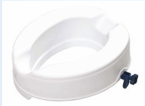
DE-60010 TOILET RAISER