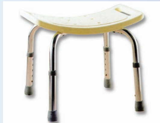
DE-62102 U-SHAPED SHOWER CHAIR WITH HEIGHT REGULATION LEGS