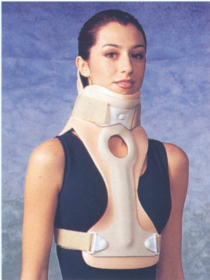
DE-1040 CERVICAL-DORSAL MINERVE