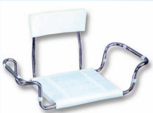
DE-62000 BATHTUB SEAT