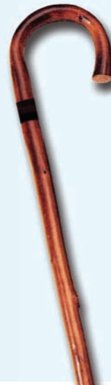
DE-41002 WOODEN WALKING STICK