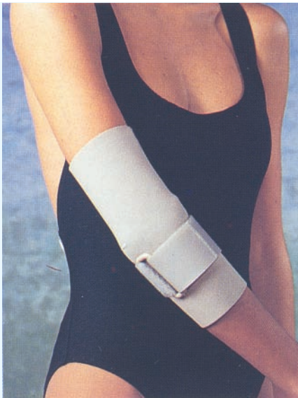
DE-2232 NEOPRENE ELBOW SUPPORT