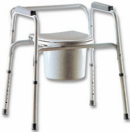
DE-61100 TOILET CHAIR